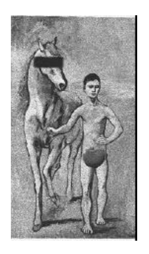
Postage stamp, D. Viterbo