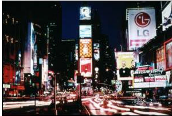
The new Times Square